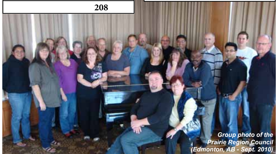
Group photo of the Prairie Region Council (Edmonton, AB - Sept. 2010)