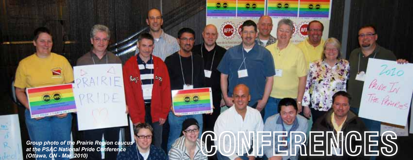
Group photo of the Prairie Region caucus at the PSAC National Pride Conference (Ottawa, ON - Mar. 2010)