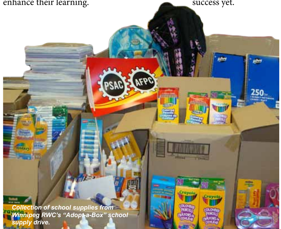
Collection of school supplies from Winnipeg RWC's "Adopt-a-Box" school supply drive.

The following year, the Winnipeg RWC's annual "Adopt-a-Box" school supply drive was the biggest success yet.