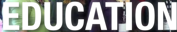
Group photo of the participants of the Young Workers in Action course (Edmonton, AB - Nov. 2010)