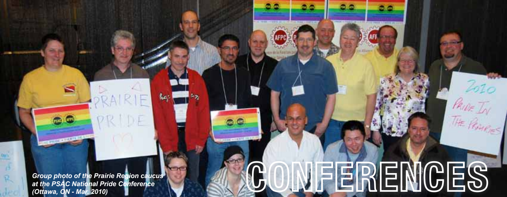
Group photo of the Prairie Region caucus at the PSAC National Pride Conference (Ottawa, ON - Mar. 2010)