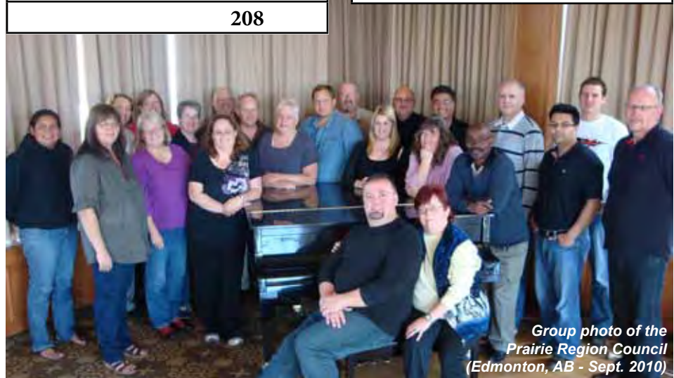
Group photo of the Prairie Region Council (Edmonton, AB - Sept. 2010)